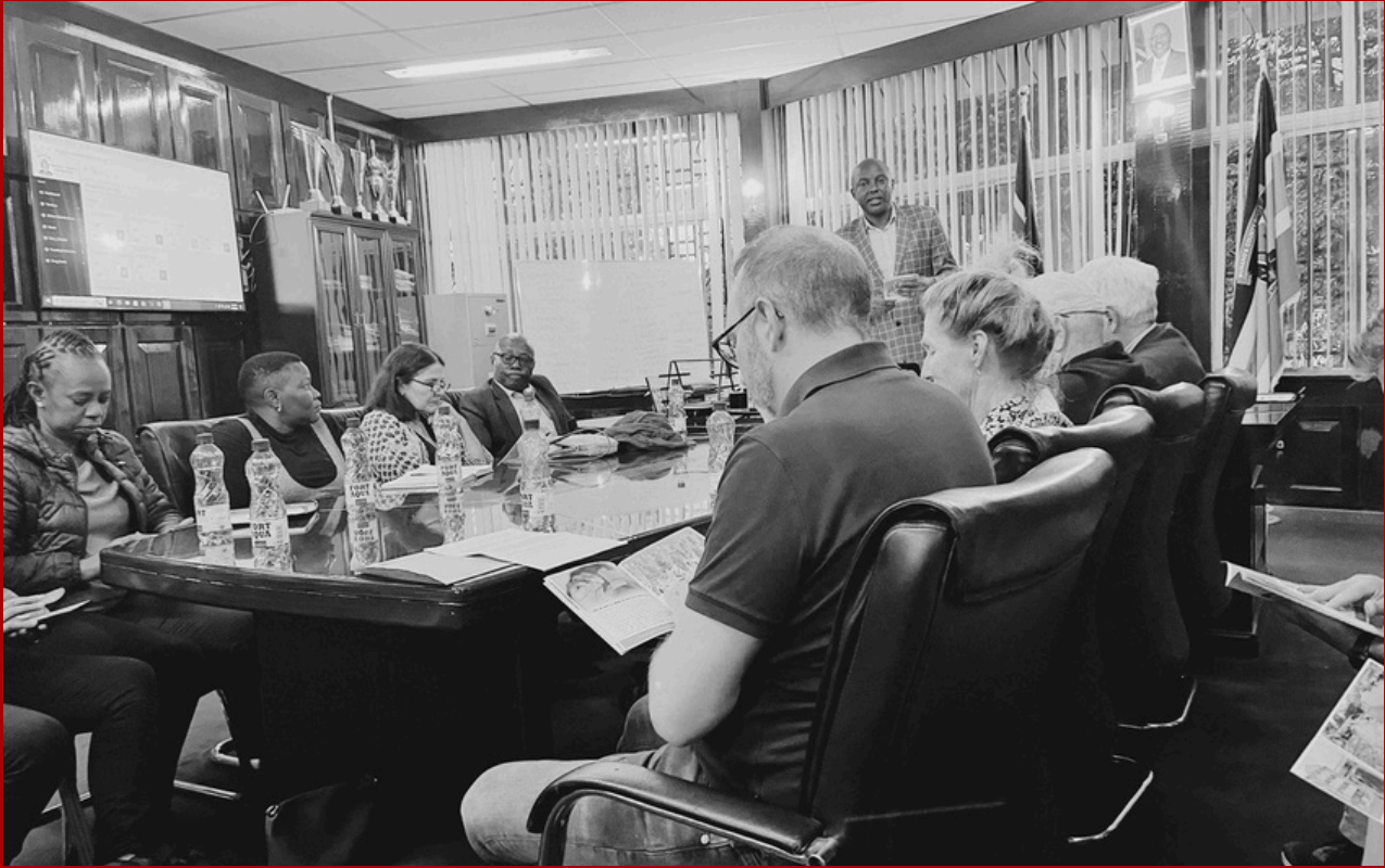
Debriefing meeting with district governor